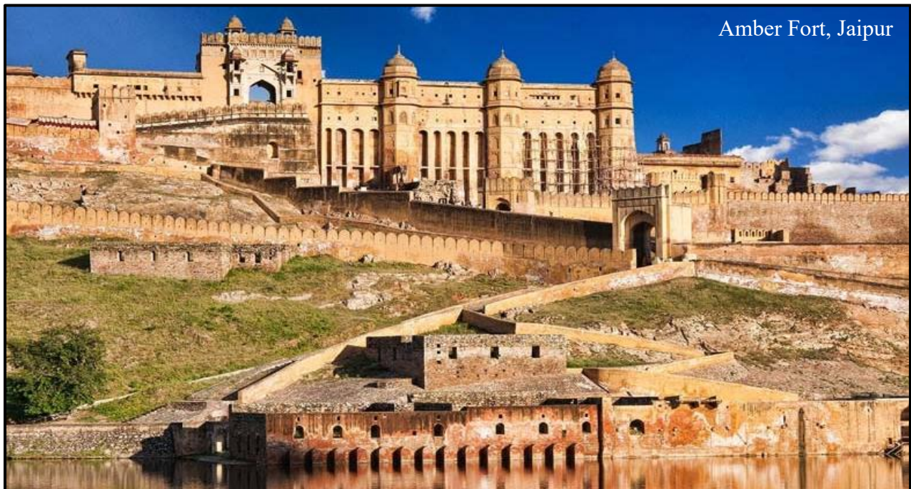
Amber Fort, Jaipur