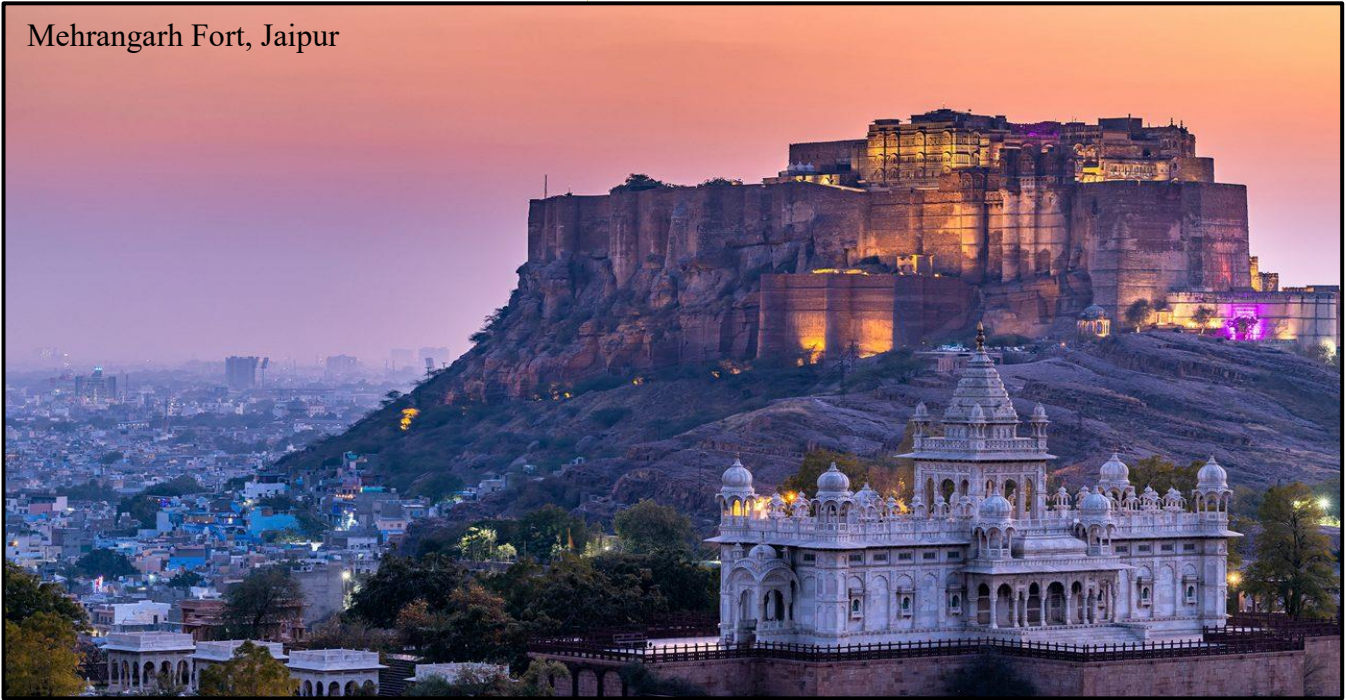
Mehrangarh Fort, Jaipur