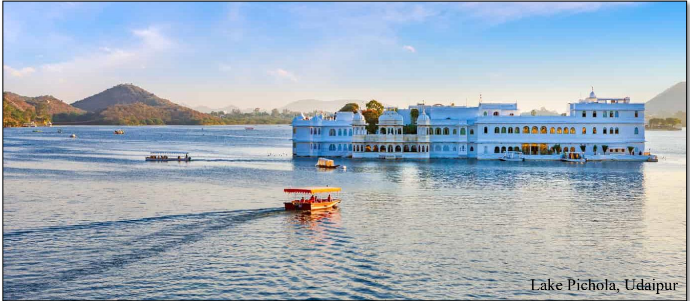
Lake Pichola, Udaipur