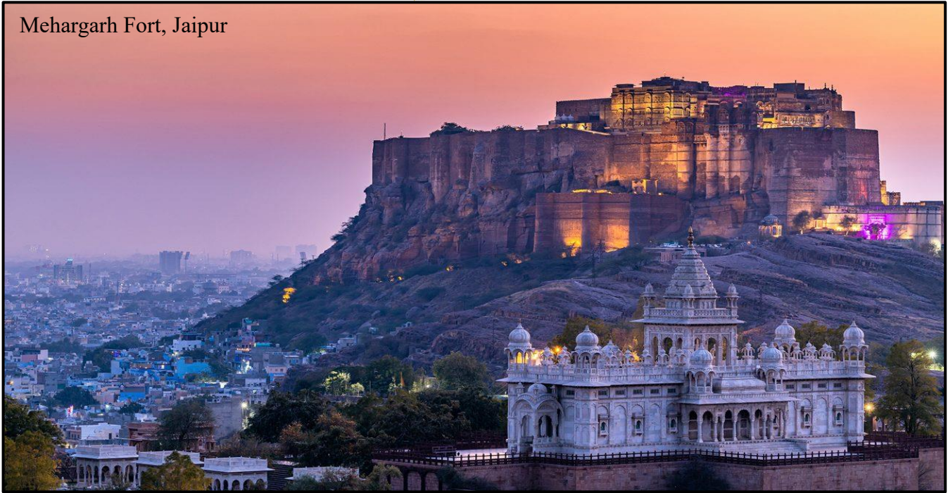
Mehargarh Fort, Jaipur